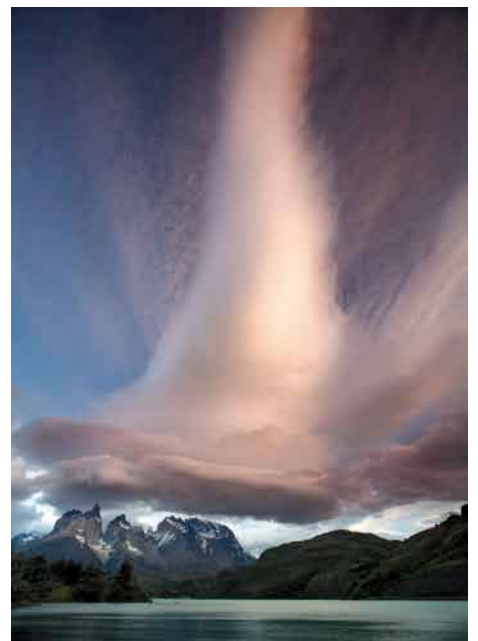
RIGHT Torres del Paines, Chile. The landscape of the park is dominated by the Paine massif, which is an eastern spur of the Andes, located on the east side of the Grey Glacier, rising dramatically above the Patagonian steppe. Here, with typical Wolfe artistic flair, the massif is dominated by the extraordinary cloud formations. Taken with a Canon 5D, 16-35mm lens @ 17mm, 0.3s @ f/7.1, ISO 100.

spaces in his images) and Jackson Pollock (for unbridled abstract expressionism).